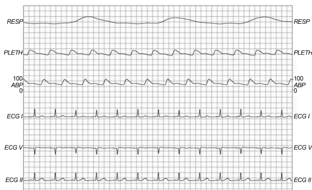
Fig. 3. An example of high-resolution waveforms. RESP: respiration, PLETH: plethysmogram, ABP: arterial blood pressure, ECG: electrocardiogram.

ICD-9: International Classification of Diseases 9th Revision, DRG: Diagnosis Related Group, IV: intravenous, ECGs: electrocardiograms, CPT: Current Procedural Terminology, SAPS: Simplified Acute Physiology Score, SOFA: Sequential Organ Failure Assessment.